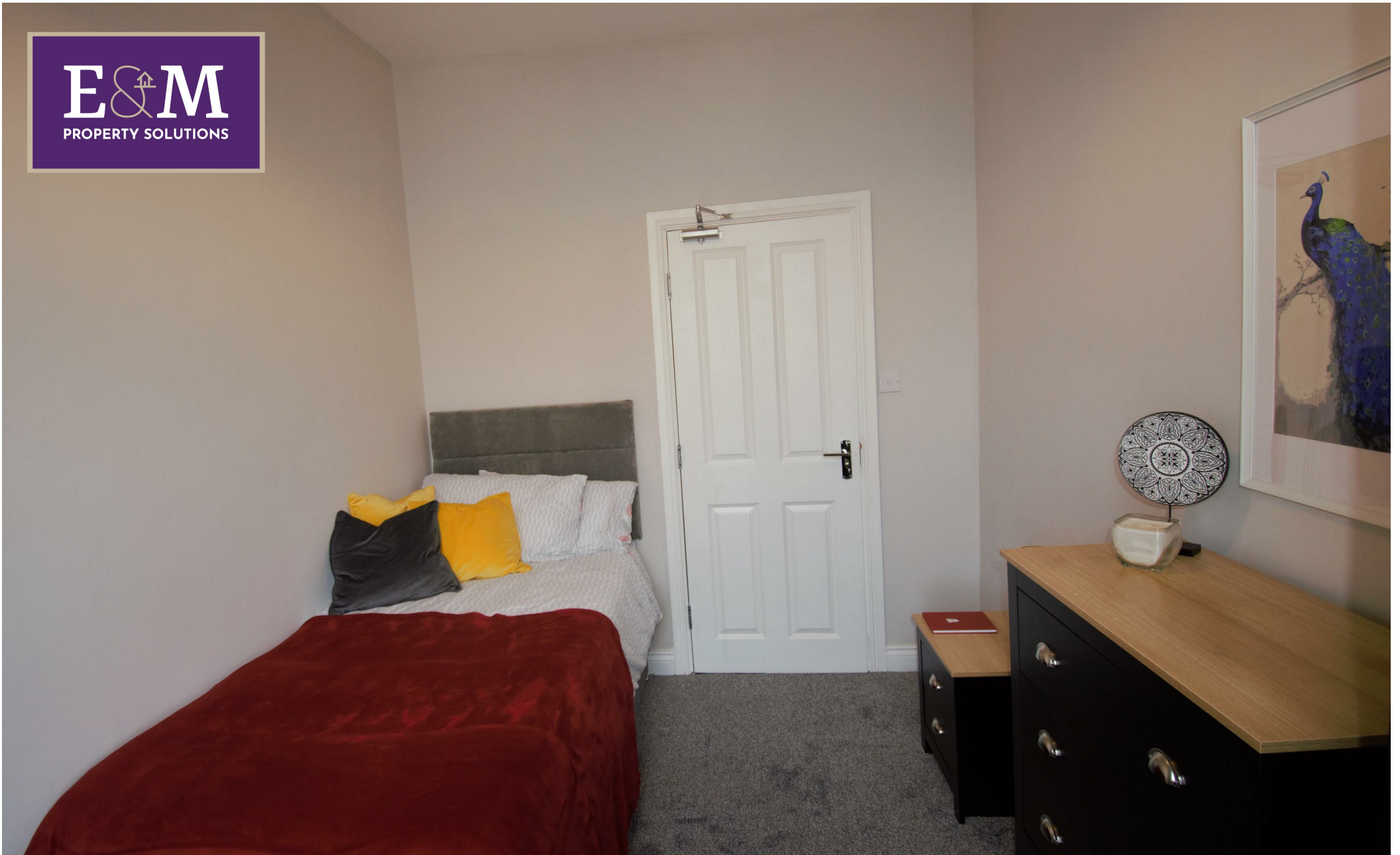
Room 3, 1 Bulcock Street, Burnley, Lancashire, BB10 1UH £90 Per week